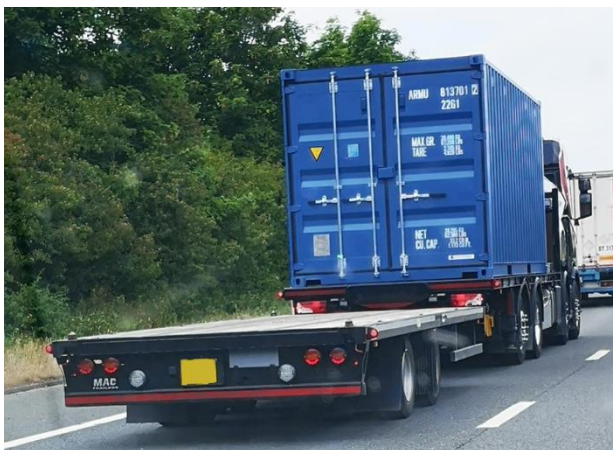
Wagon and drag

Below are images showing a wagon and drag vehicle and one with a rear mounted hiab crane (most are at the front just behind the cab).