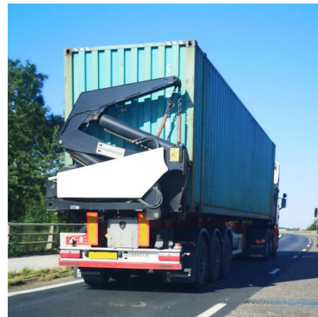
Rear mounted hiab crane